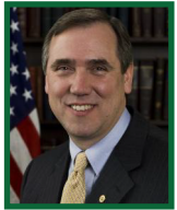
Senator Jeff Merkley