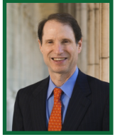
Senator Ron Wyden