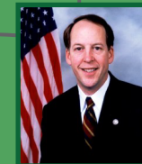
DISTRICT 2 Rep Greg Walden 2012: $8,206,851