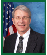
DISTRICT 5 Rep Kurt Schrader 2012: $12,345,487