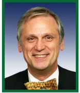
DISTRICT 3 Rep Earl Blumenauer 2012: $1,396,765